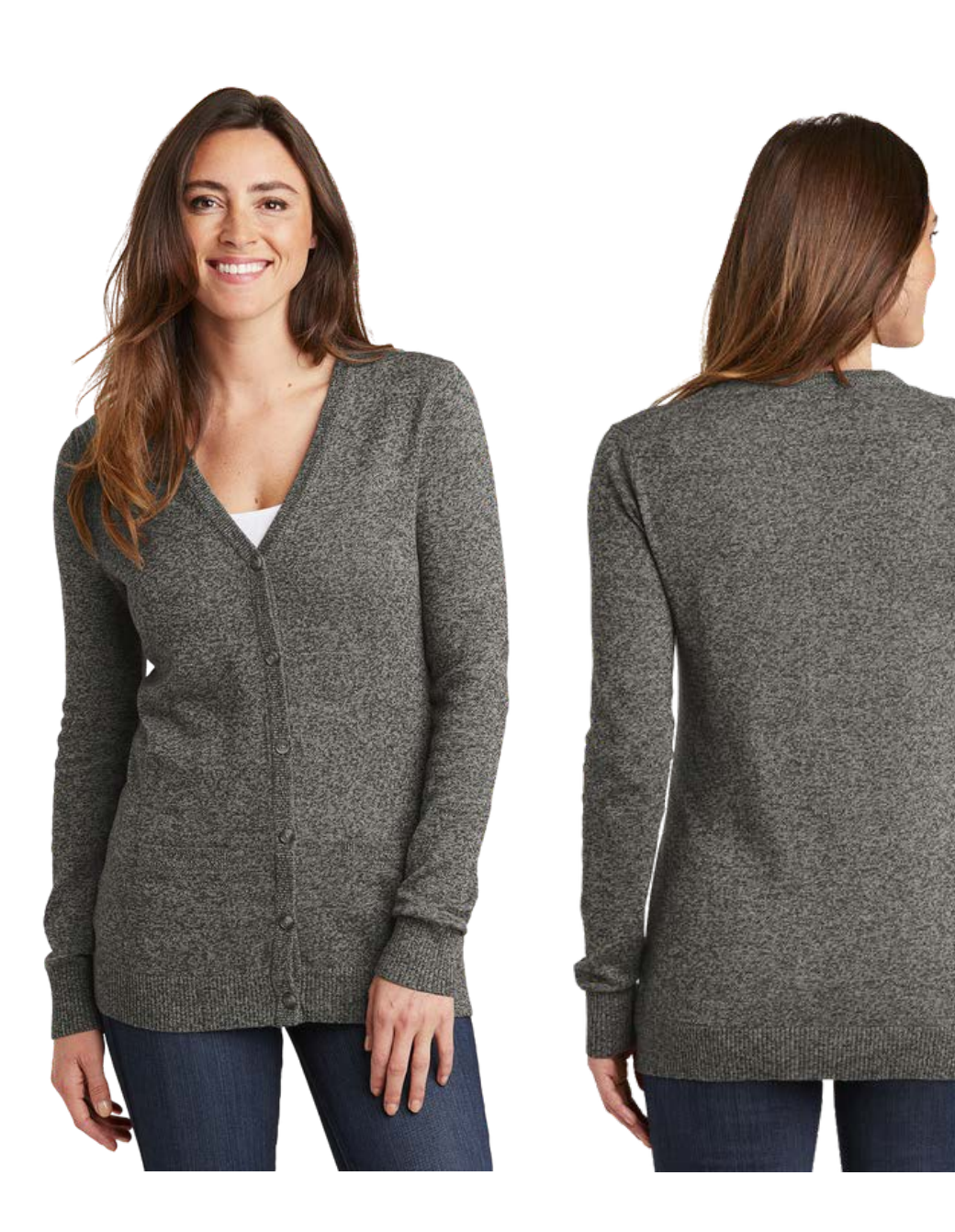
COLORS Navy Marl, Warm Grey Marl,

Made for layering, this two-toned marled cardigan livens up any office or casual look.