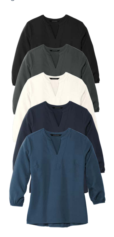
4.3-ounce, 95/5 poly/spandex

Deep Black, Anchor Grey, Ivory Chiffon, Night Navy, Insignia Blue