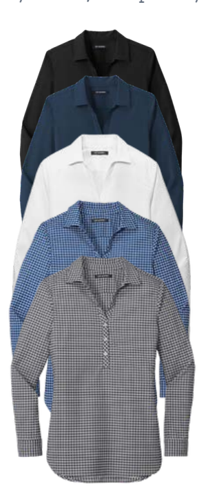
3.7-ounce | 93/7 poly/spandex | Odor-fighting | Wrinkle-resistant | Moisture-wicking | Open collar and neckline | Longer tunic length | Pearlized buttons | Rounded adjustable cuffs | Curved hem

Black, River Blue Navy, White, True Blue/White, Graphite/White