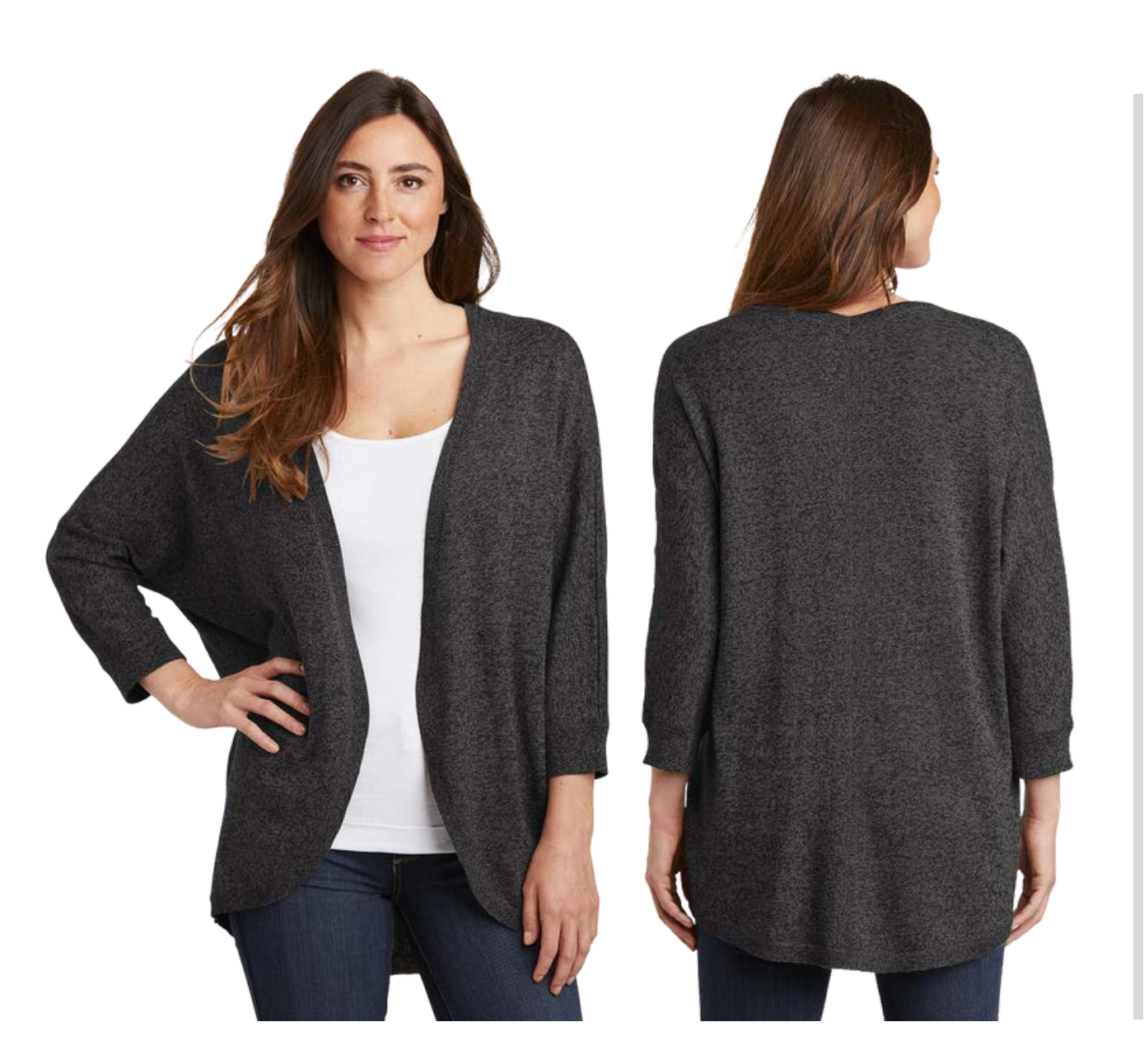
COLORS Warm Grey Marl, Black Marl

Wrap yourself in a cozy cocoon designed with exceptional drape and unrestricted movement.