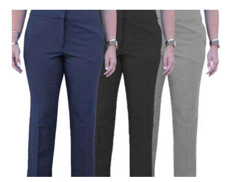
Fabric + Care: 62% Recycled Poly | 33% Viscose | 5% Spandex | Year-round weight | Antibacterial | Machine Washable