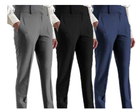
Fabric + Care: 62% Recycled Poly | 33% Viscose | 5% Spandex | Year-round weight | Antibacterial | Machine Washable