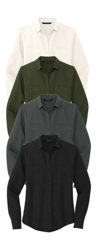
4.3-ounce, 95/5 poly/spandex

Ivory Chiffon, Townsend Green, Anchor Grey, Deep Black