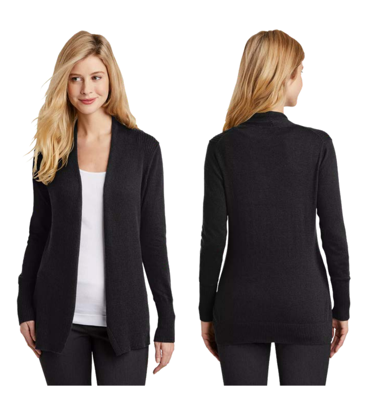
COLORS Biscuit, Black, Medium

This soft, cozy cardigan sweater has a flattering drape and features fully-fashioned sleeves for strength and enduring wear. Stylish longer rib knit height details at cuffs and hem.