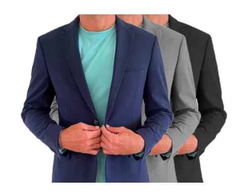
Fabric + Care: 62% Recycled Poly | 33% Viscose | 5% Spandex | Year-round weight | Antibacterial | Machine Washable