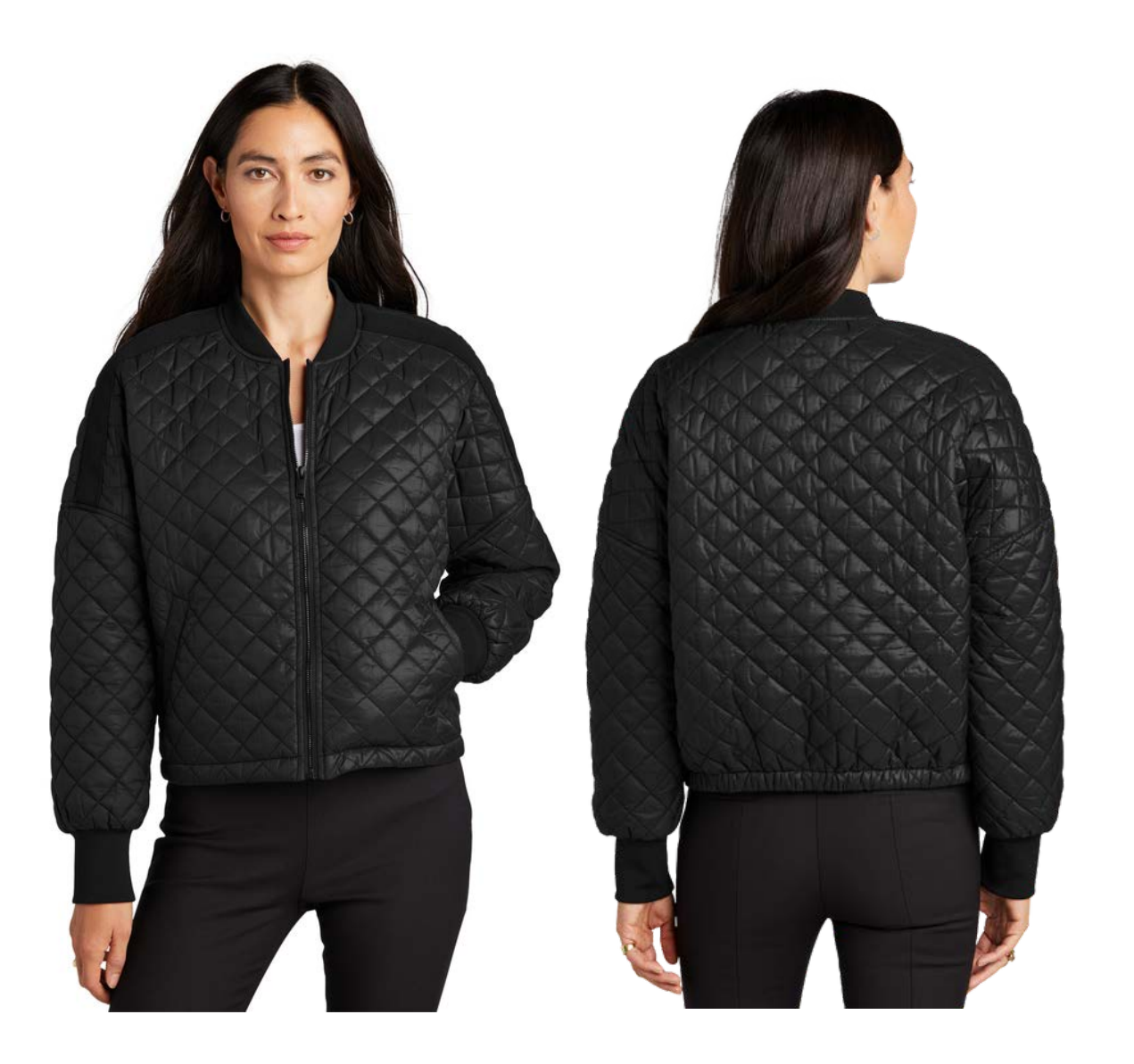
COLOR Deep Black

With reliable warmth and durable water-repellency in a lightweight package, this trend-forward jacket is made for night-to-day wear. The subtle sheen finish, diamond quilt and oxidized molded zipper make it a beyond-basic essential.