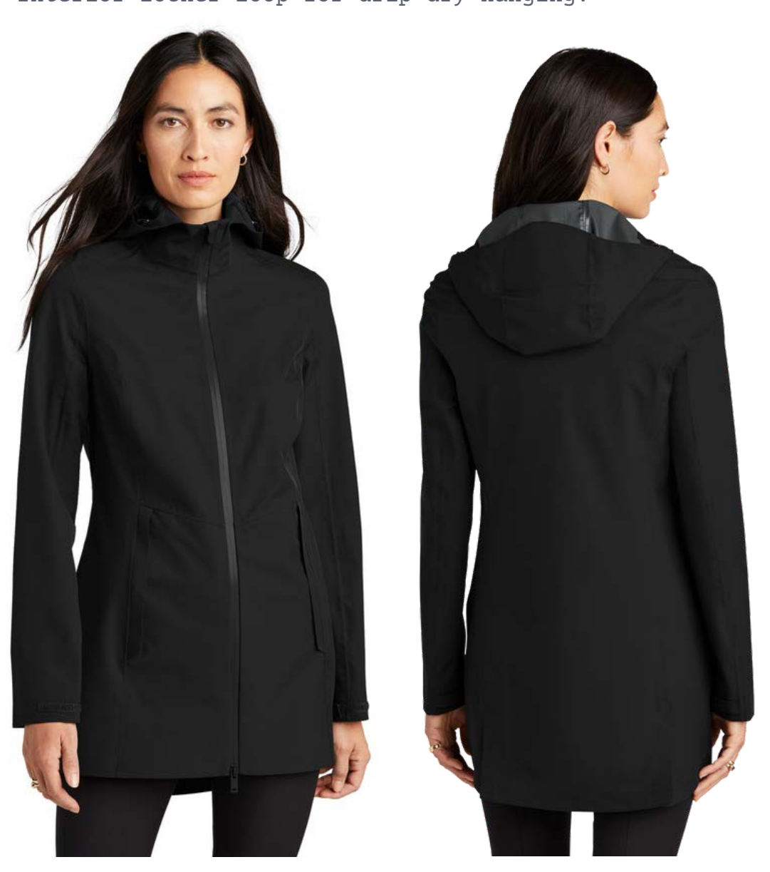
COLORS Deep Black, Anchor Grey

High style and high performance unite in our fully seam-sealed jacket. Functional design details like a three-panel locking drawstring hood, an interior storm flap and reinforced waterproof zipper help keep rain at bay. Store essentials in the reverse-coil zip pockets. Interior locker loop for drip-dry hanging.