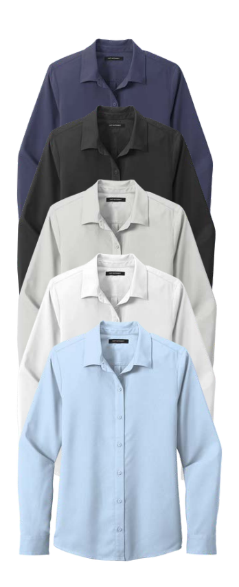
3.3-ounce, 100% polyester

True Navy, Black, Silver, White, Cloud Blue