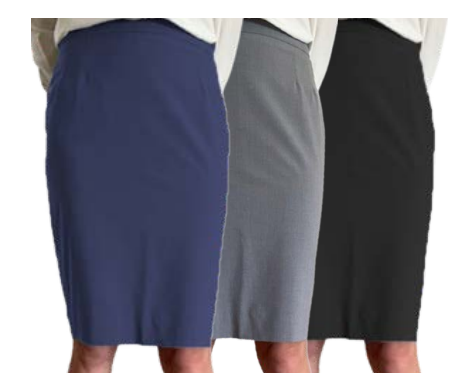
Fabric + Care: 62% Recycled Poly | 33% Viscose | 5% Spandex | Year-round weight | Antibacterial | Machine Washable