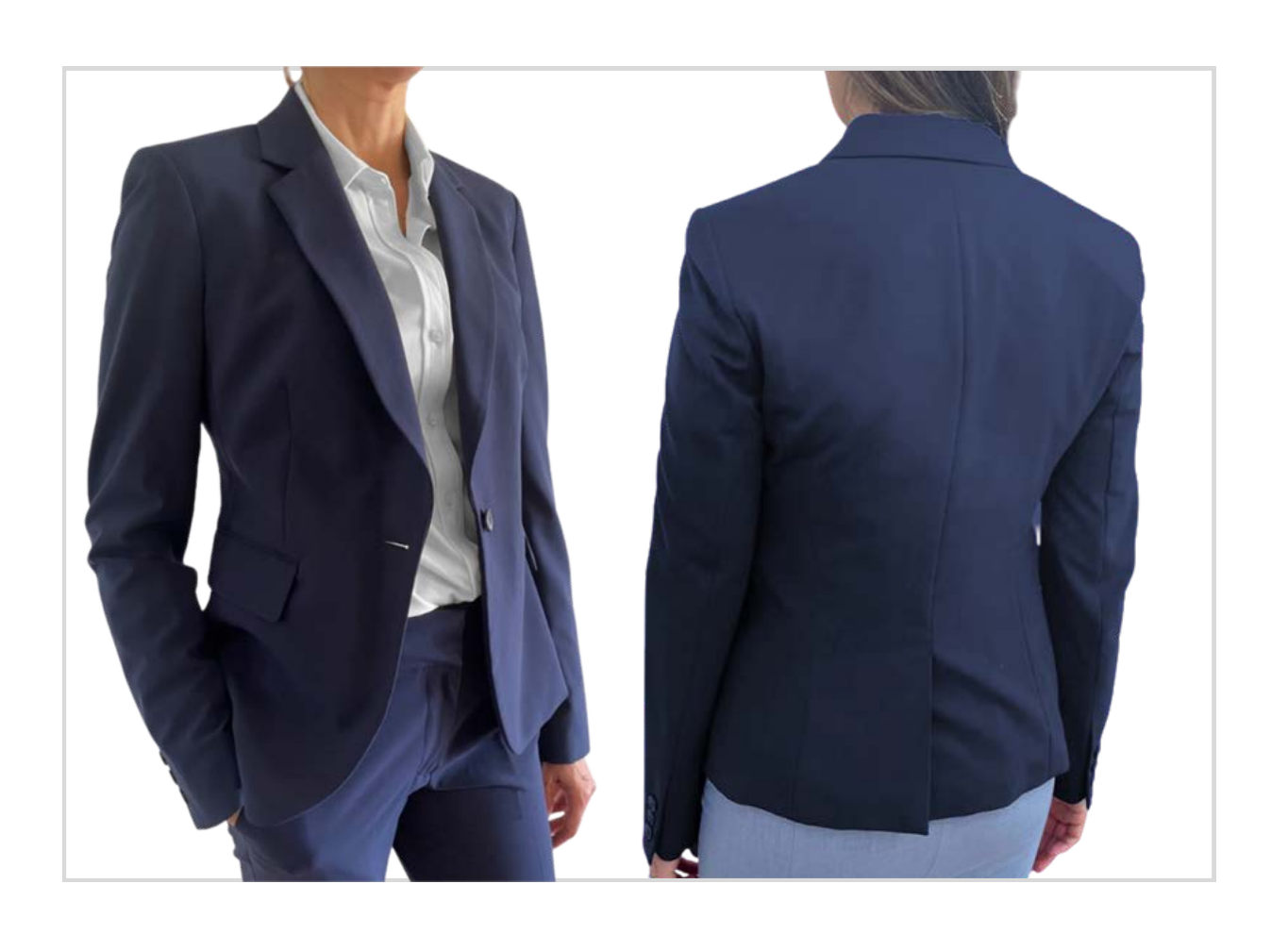
COLORS Grey Melange, Bright Navy, Black

Details: Notch lapel | 1-button single breasted | Single vent | Stretch armhole | Non functional buttons at cuff | Flap pockets | Stretch fabric and lining.