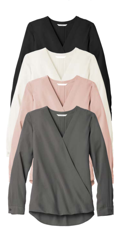
Fabric: 4.1-ounce, 100% polyester crepe

Black, Ivory Chiffon, Rose Quartz, Sterling Grey