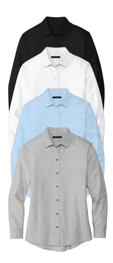
3.7-ounce, 56/36/8 cotton/poly/spandex