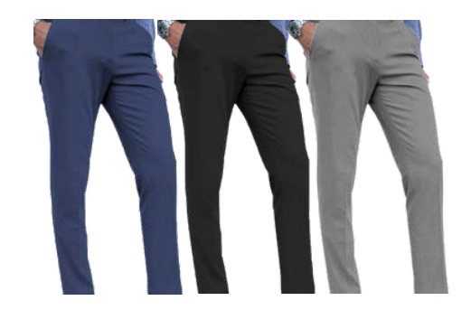
Fabric + Care: 62% Recycled Poly | 33% Viscose | 5% Spandex | Year-round weight | Antibacterial | Machine Washable