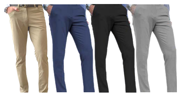
Fabric + Care: 89% Recycled Poly | 11% Elastane | Antibacterial | Machine Washable