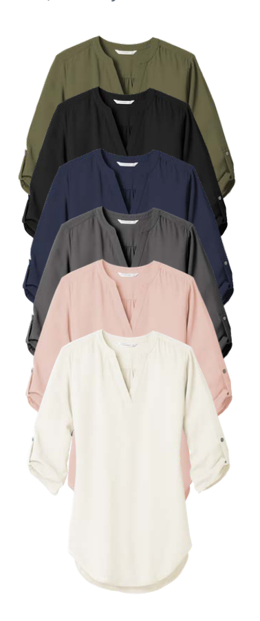
4.1-ounce, 100% polyester crepe

Deep Olive, Black, True Navy, Sterling Grey, Rose Quartz, Ivory Chiffon