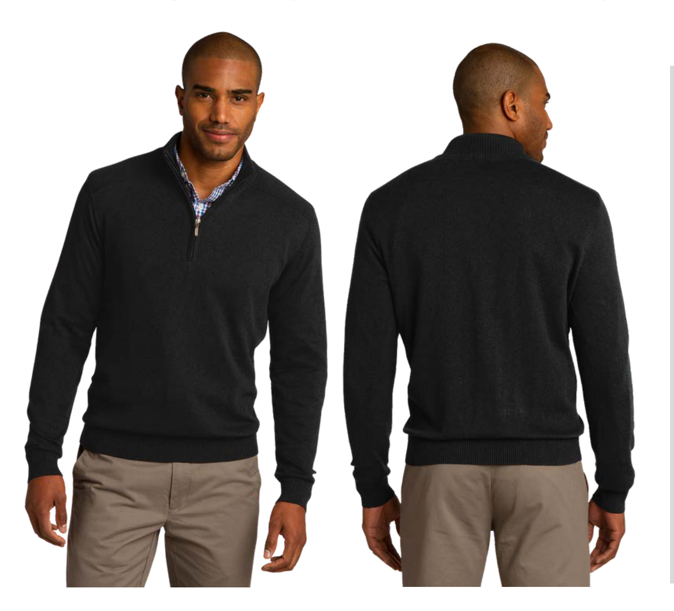
COLORS Black, Navy, Charcoal Heather

With rib knit details, this fine-gauge layerable sweater is just right for a day in the office or night out. Fully-fashioned sleeves add durability and ease of motion.