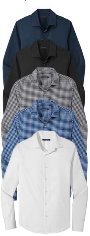
3.7-ounce, 93/7 poly/spandex | Odor-fighting | Wrinkle-resistant | Moisture-wicking | Open collar French placket | Pearlized buttons | Rounded adjustable cuffs

River Blue Navy, Black, Graphite/White, True Blue/White, White