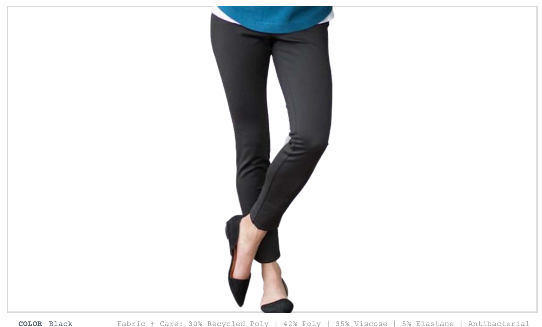
Fabric + Care: 30% Recycled Poly | 42% Poly | 35% Viscose | 5% Elastane | Antibacterial | Machine Washable

Details: Slim fit | Side zip | Stretch waistband | Adjustable hem (can be work cropped or full length).