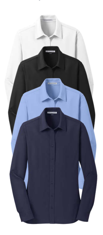
3.8-ounce, 100% micropique polyester tricot | Open collar | Dyed-to-match buttons | Rounded adjustable cuffs

White, Black, Dress Shirt Blue, Dark Navy