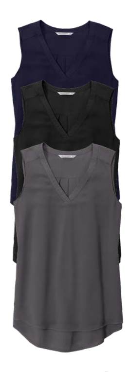
4.1-ounce, 100% polyester crepe | Back yoke with pleats | Sleeveless V-neck styling | Longer length | Curved drop tail hem