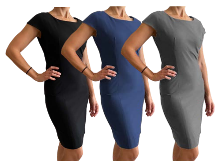
Fabric + Care: 62% Recycled Poly | 33% Viscose | 5% Spandex | Year-round weight | Antibacterial | Machine Washable