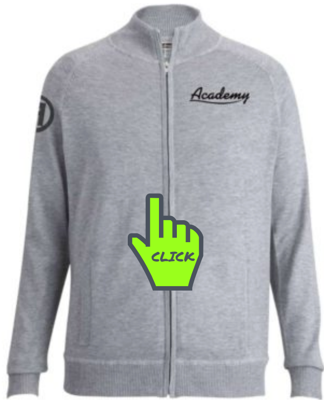
Unisex Full-Zip Sweater $55.00