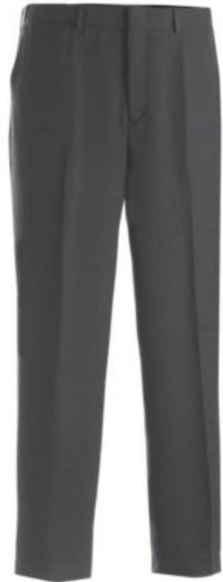
Mens Repreve Stretch Pant $42.00 - $67.00