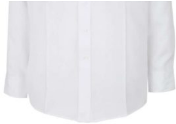
Mens LS Academy Bus Shirt $33.00