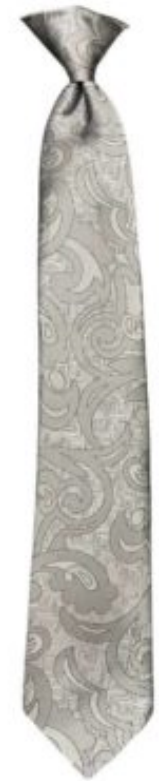
Academy Bus Tie $6.50 - $16.00