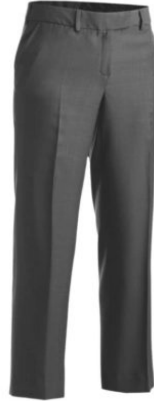
Ladies' Repreve Stretch Pant $42.00