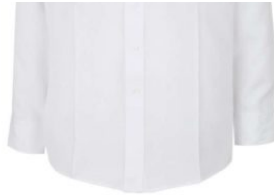
Womens LS Academy Bus Shirt $33.00