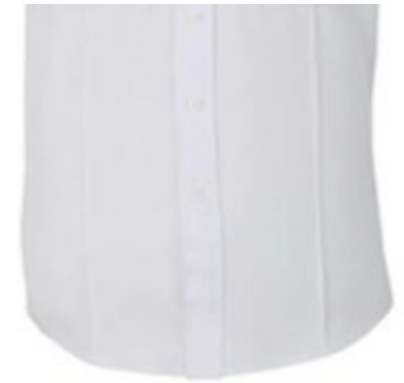
Womens SS Academy Bus Shirt $33.00